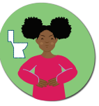
Vomiting / Diarrhea