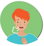
Shortness of Breath